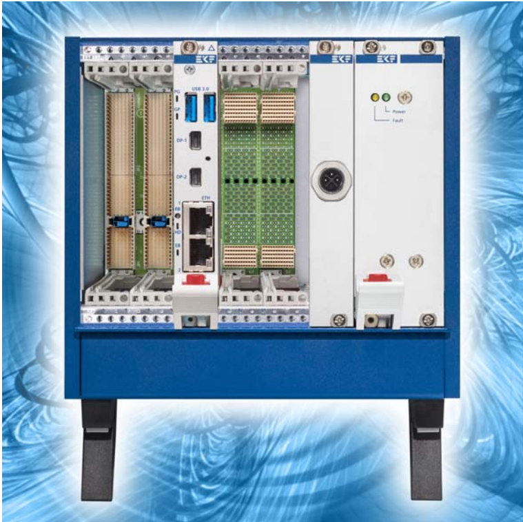
M12 Power Connector S-Coded (AC)