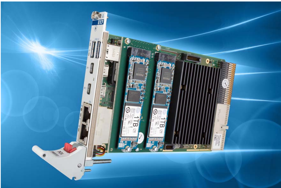
CompactPCI® PlusIO CPU Card

For popular SRP-BLUBOXX SKUs please refer to www.ekf.com/liste/liste_21.html#SRP